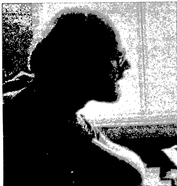
Free West Indian