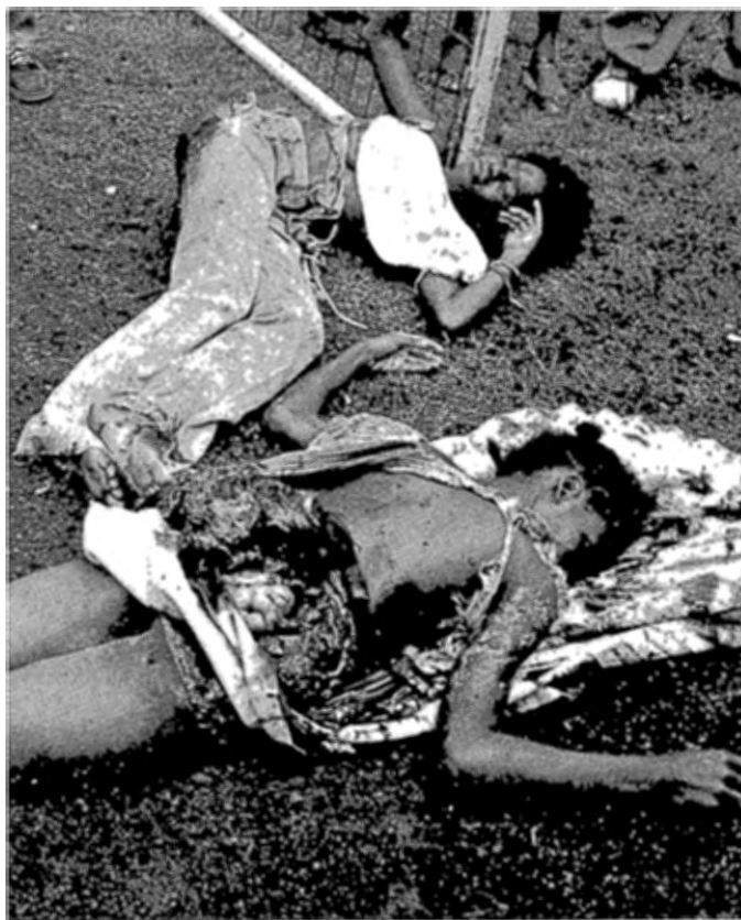
Two victims of CIA/counterrevolutionary bombing. The human reality of U.S. destabilization against Grenada.

Of course, under Gairy there was little reason to have agents on Grenada other than the run-of-the-mill AIFLD hacks. But all of the incidents noted above occurred after the revolution and during the Carter administration; they do not suggest an unwillingness to act forcefully against Grenada. Moreover, the only known deaths during the period in question, other than the victims of the Queens Park bombing, were gang members.