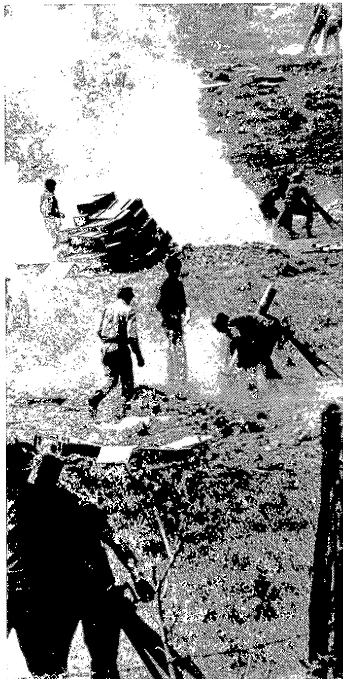
Sandinista Militia fights off contra attack.

• October 18 saw a massacre more vicious than any of the previous contra raids, all of which were bloody and heartless. The small village of Pantasma was attacked by a band of over 250, slaughtering 47 people, including six teachers and most of the workers on two area agricultural cooperatives. The townspeople fought heroically for ten hours until soldiers reached the remote mountain village and drove off the contras . As one shocked villager said, "What they did here has no name."