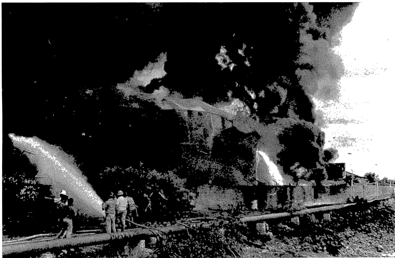
El Nuevo Diario.